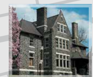
Greystone Mansion (52 S. 1st Ave.)