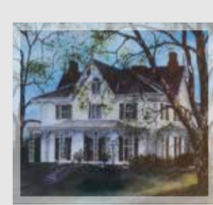
Terracina Loretta Englerth