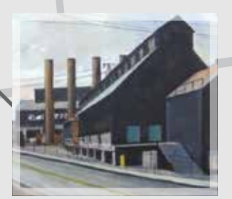
Klaus Grutzka (from 200 1st Ave.)