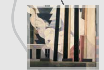
Charles Demuth (from 1st Ave.)