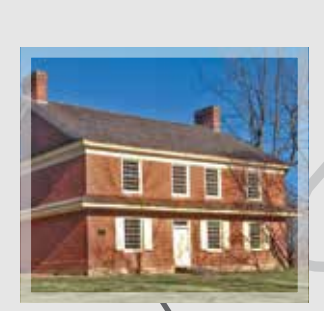
Primitive Hall (830 N. Chatham Rd. West Grove)