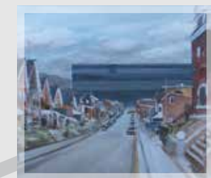
Klaus Grutzka (from 395 Charles St.)